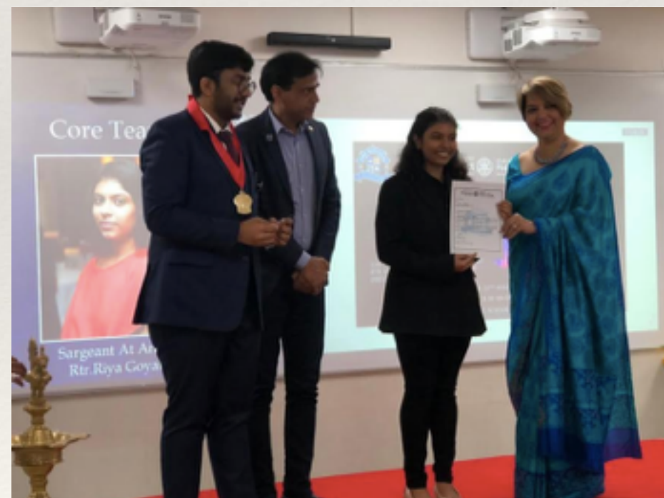
Rotaract Club Of Podar World College