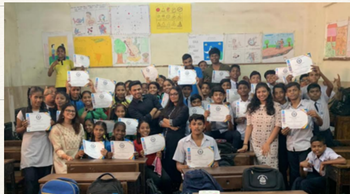
The SLP programme