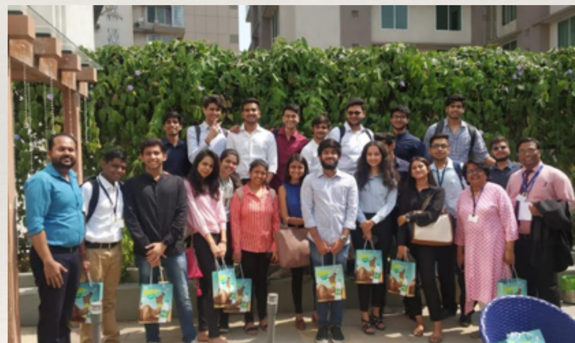
Visit to Bisleri