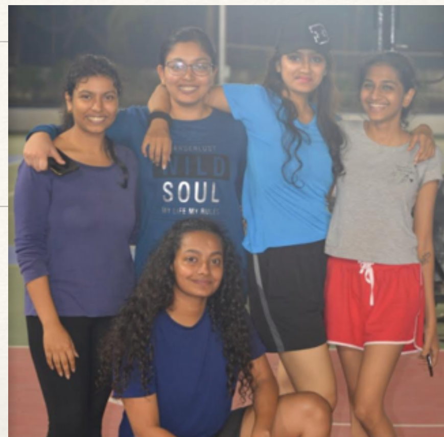
The basket ball match