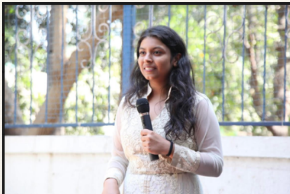
Hosting the holi ceremony