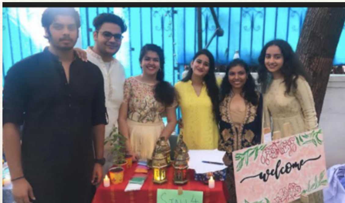
Our ECI event