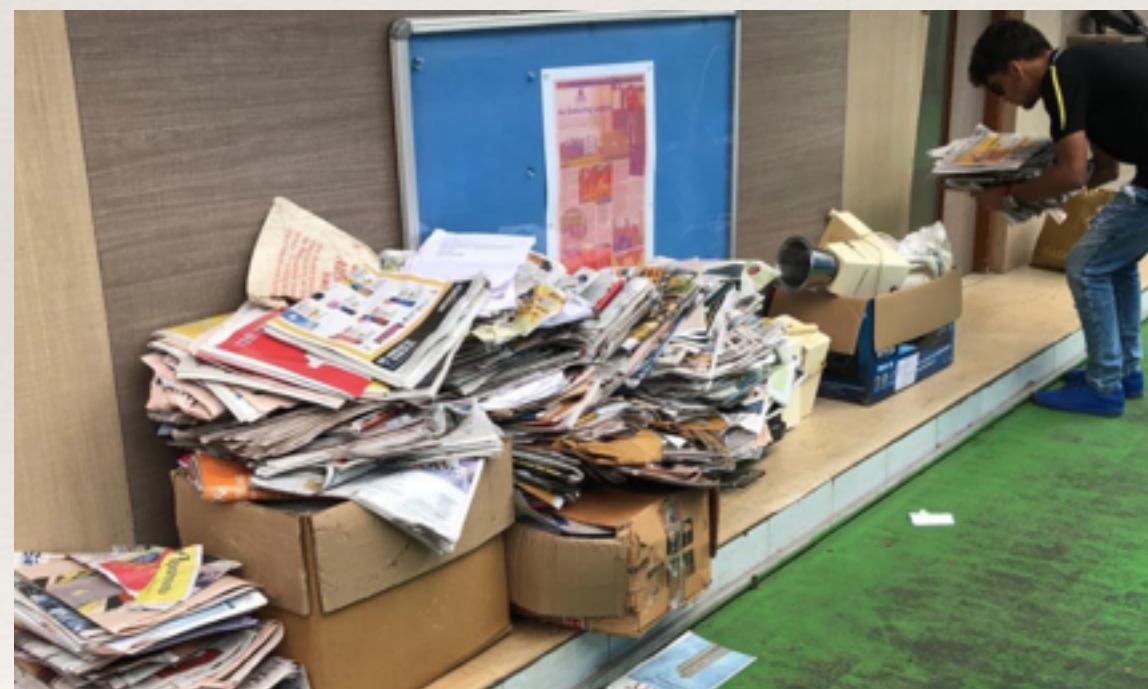
Waste to knowledge- CSR activity that I subheaded